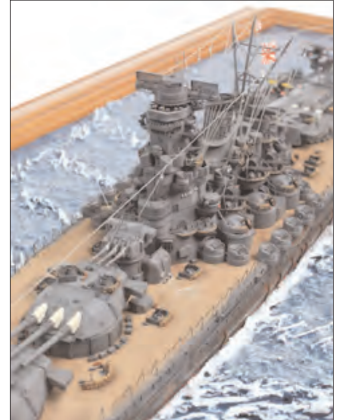
Alan Chung IJN Yamato