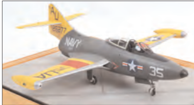
Rene de Koning F9F-5 Panther