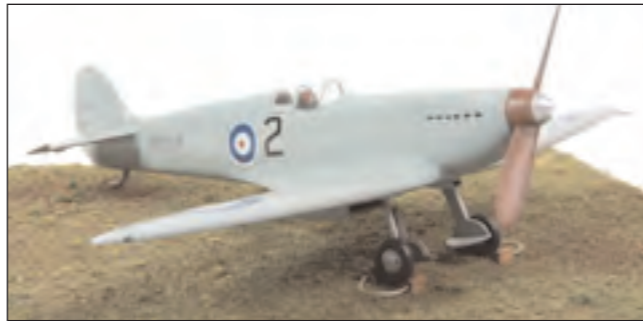
Ian Vale Spitfire Prototype Brian Thewlis Supermarine Attacker